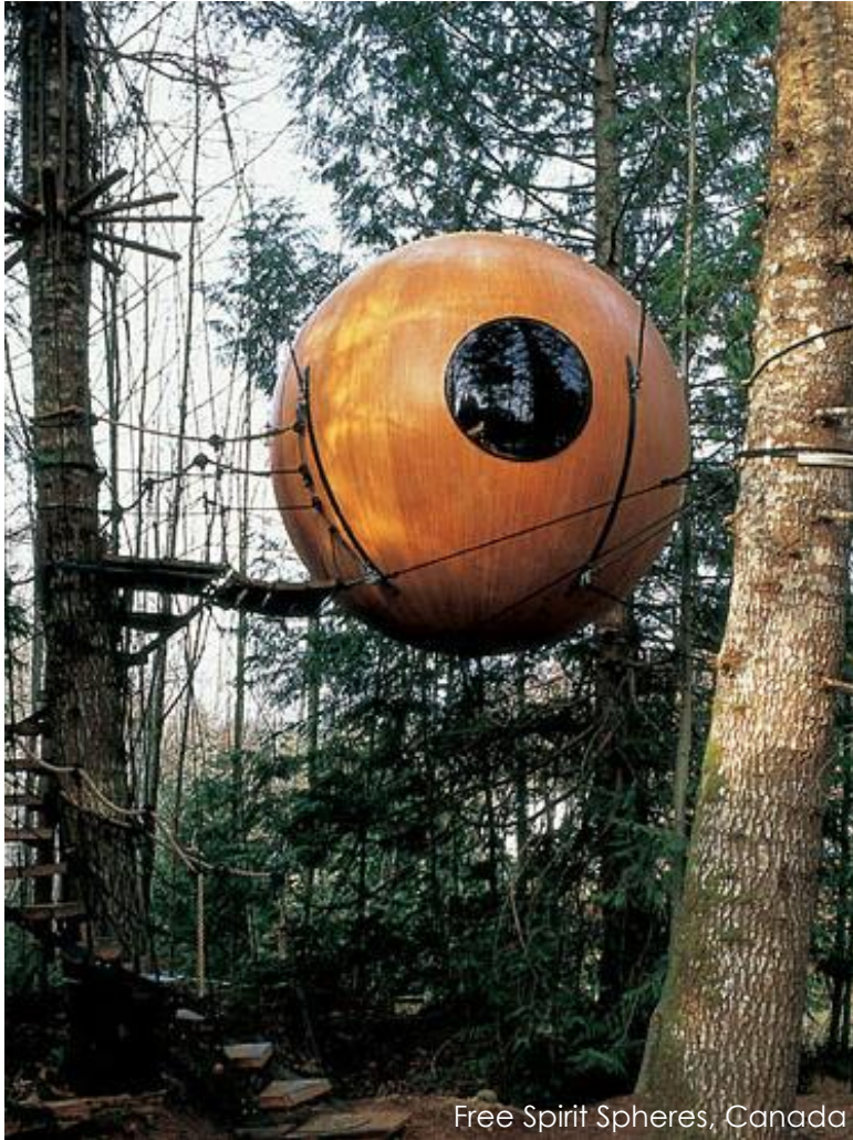
Free Spirit Spheres, Canada

In the past few years , a worldwide trend has developed offering outdoor enthusiasts an inventive alternative to the easy recreation of camping outdoors.