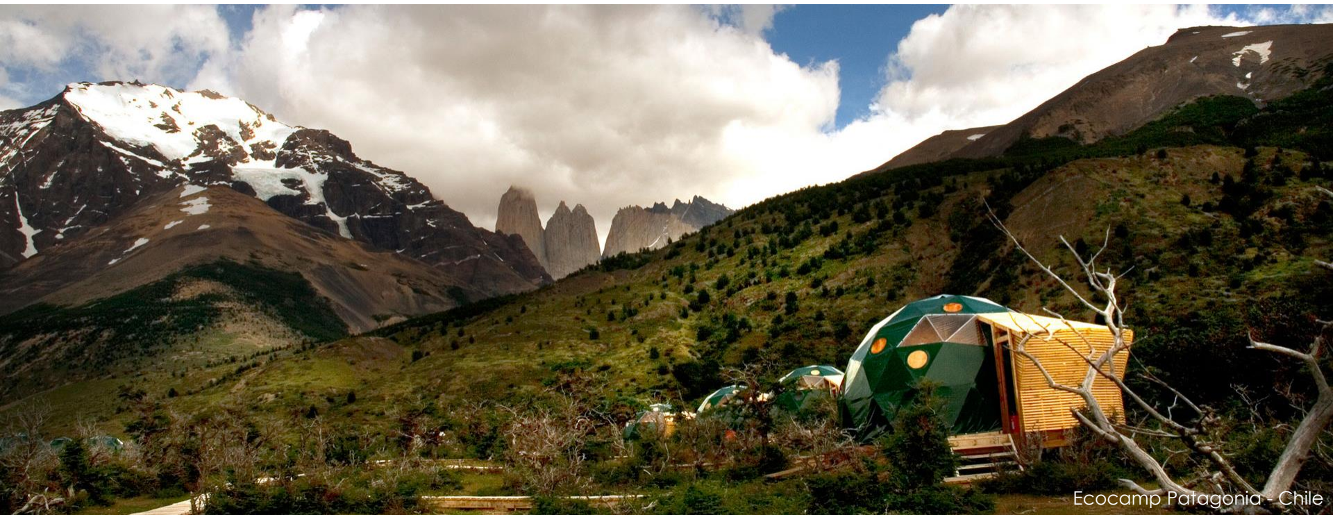
Ecocamp Patagonia - Chile

Mango Architecture , in collaboration with ArchiVoice , is happy to announce the new ideas competition – ‘ Glamping–The Glamorous way of Camping ’.