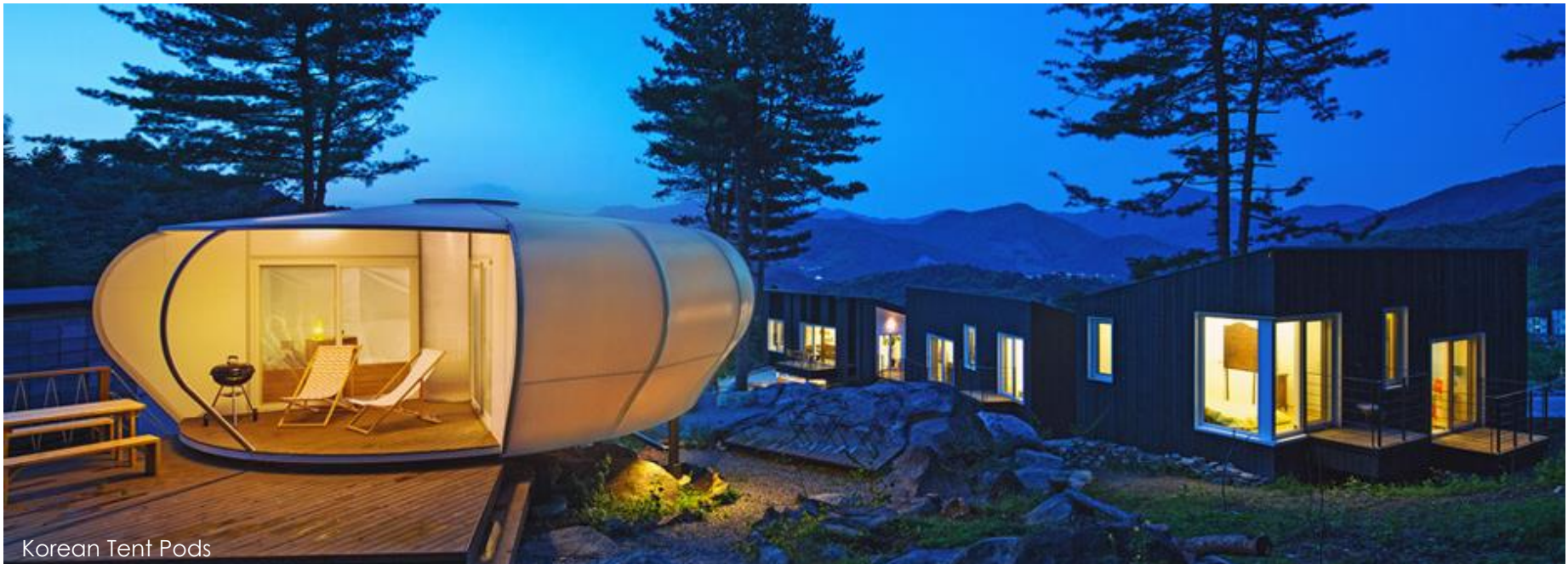
Korean Tent Pods

The cabin and its design should comfortably adapt to suit various environments which means it can withstand heavy rain, wind flow, UV-proof, snowfall as well as keep out unwanted guests such as primates, reptiles and insects. With the potential of becoming an iconic part of the landscape itself. The cabin must provide guests with safe and comfortable lodgings, allowing the guests to rest and enjoy the panoramic views of natural surroundings.