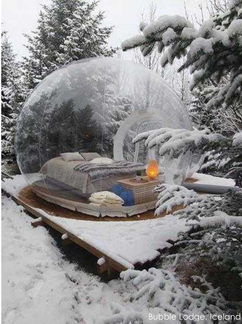
Bubble Lodge, Iceland

Few of the design objectives which you need to keep in mind while designing the proposal: